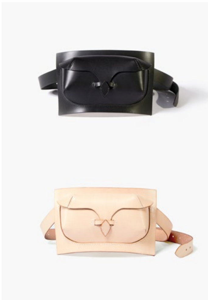
AJAR belt bag black / natural naturally tanned leather edition of 97 490 eur