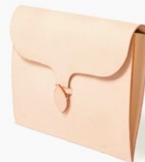
CAMIL clutch black / natural naturally tanned leather edition of 97 440 eur