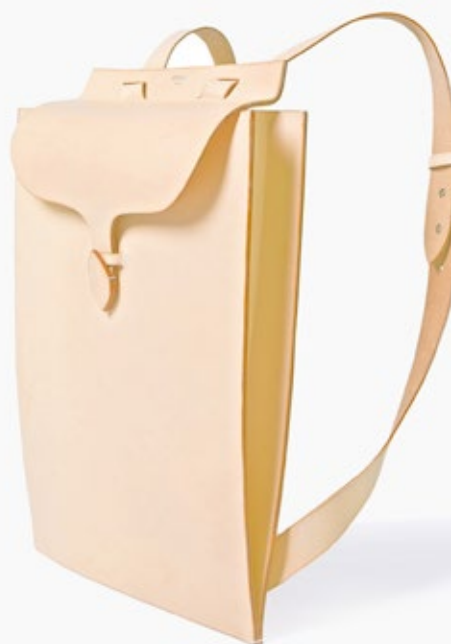
RIHAM backpack black / natural naturally tanned leather edition of 97 780 eur