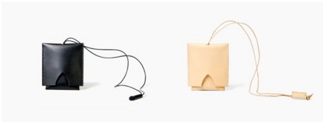
Cards case necklace black / natural naturally tanned leather 176 eur