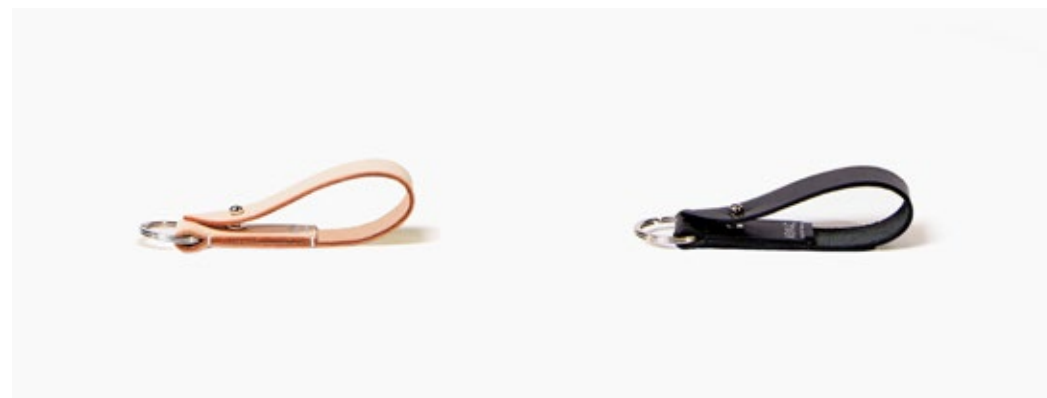
Key ring black / natural naturally tanned leather 66 eur