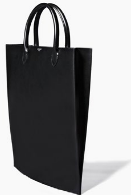
SABAH tote bag black / natural naturally tanned leather edition of 97 680 eur